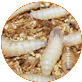
Magnified mature larvae