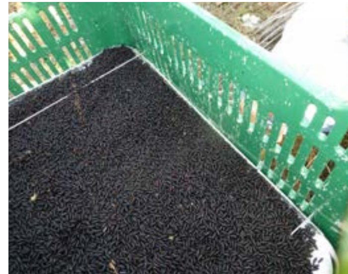
Sterilized NWS pupae released in infested area

To eradicate NWS, sterilized pupae may be placed in chambers at strategic locations throughout an infested area. Sterile flies may also be dispersed from aircraft over larger areas. As male flies emerge from the chambers, they seek out mates. Because female screwworm flies mate just once in their lifespan, the only eggs she will lay are not viable and will not develop into maggots. The population ultimately dies out as more sterile screwworm flies are released. The population of fertile screwworm flies dies off naturally over a few lifecycles.